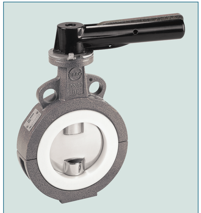
Container valve BE 80 with OPEN/ CLOSE lever.