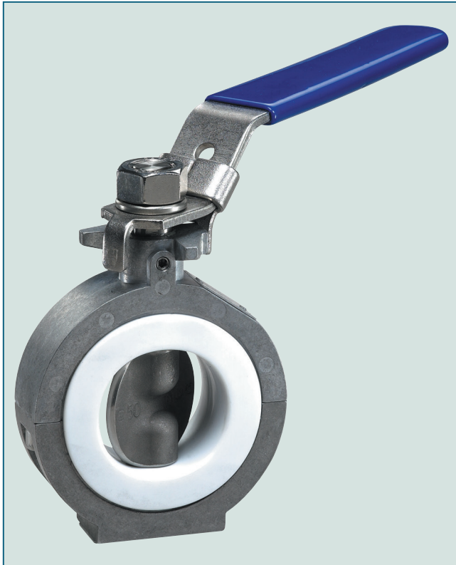
Container valve BE 50 with drain bolt lock.